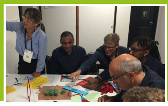
BiodivERsA engaged in the IPBES multi-stakeholder workshop developing New Visions for Nature in 2050 (Auckland, 2018)